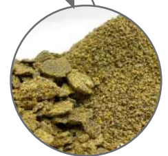
Cotton seed cake